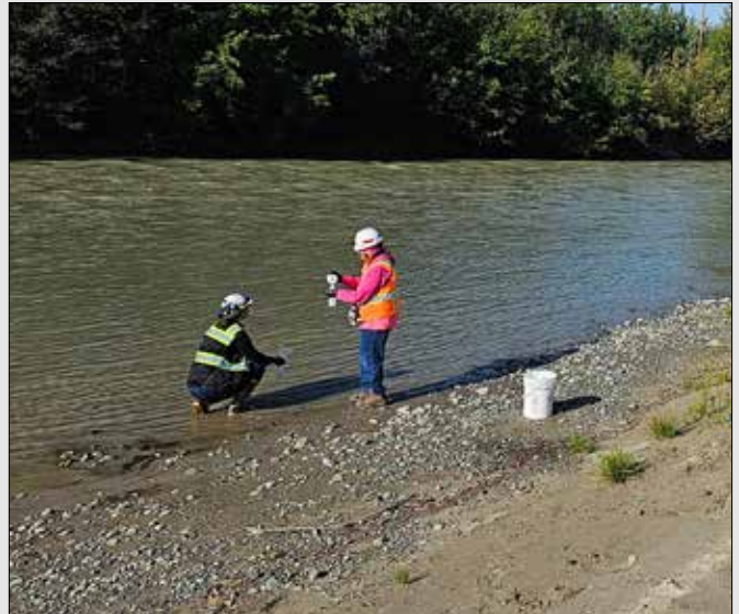
Environmental technicians routinely sample water quality downstream from Fort Knox and Manh Choh.

modeling shows trucking contributes less than 0.25% of PM2.5 emissions in Non-Attainment Area 1. The full report is posted at manhchoh.com .