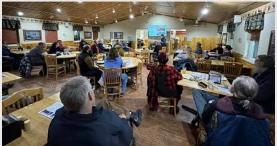
Tok community update at the Manh Choh campus on mine operations, workforce development opportunities and community investments.

In addition to the thousands of meetings and updates during the permitting stage, the Manh Choh team meets regularly with communities along the transportation corridor and surrounding villages. A Community Advisory Committee was established that comes together each quarter, supports area media through advertising and underwriting, maintains social media accounts, publishes a quarterly newsletter and keeps a website dedicated to the mine.