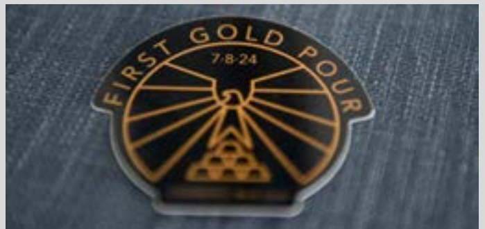
The stylized eagle in the first pour logo is the symbol of the Tetlin Tribe. It underscores the importance of conservation and respect for the land, a core principle in Athabascan culture.