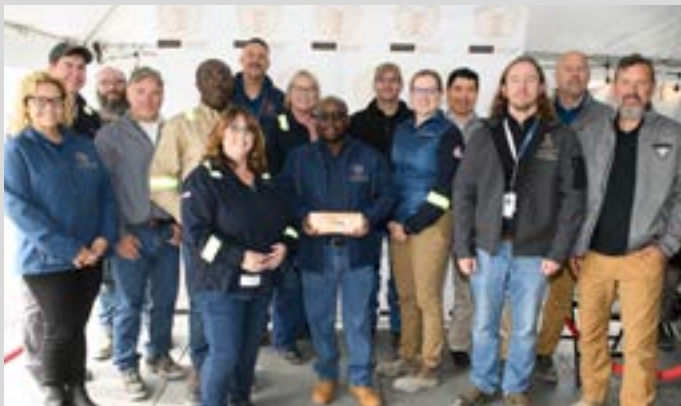
Kinross employees who worked to turn the Manh Choh prospect into a mine.