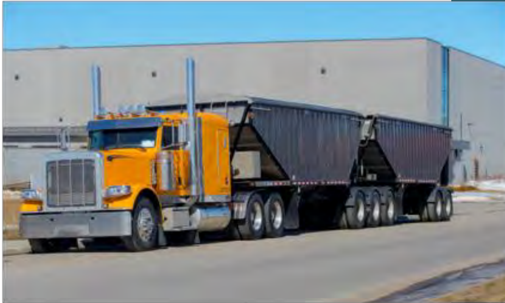
Image of similar highway truck used every day along Alaskan highways