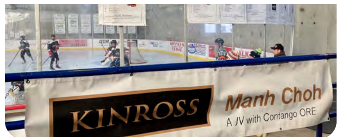
Tok Hockey Tournament – March 2021