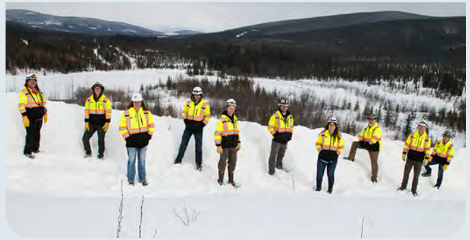
Kinross Environmental Department Staff photo