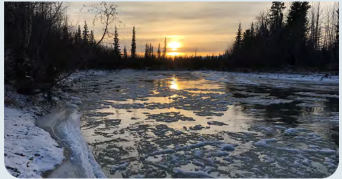
Sunset on the Tok River