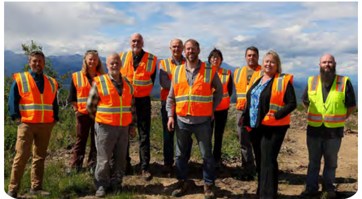
Project tour for the Interior Legislative Delegation in July

We are also starting to carry out noise and visibility surveys this August.