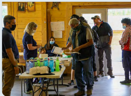
Tetlin Community Meeting